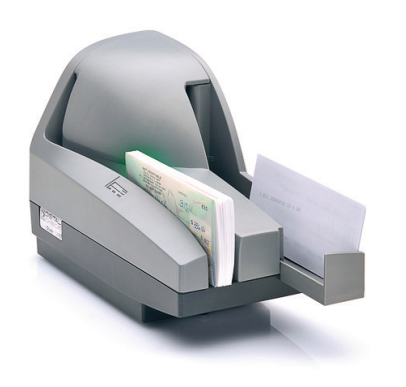
*This service is subject to credit approval.

It's like having a teller window at your desk!